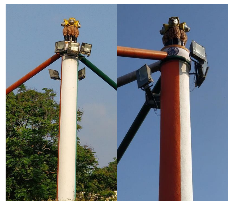
National identities and Symbols

The Republic Day (Jan 26) is celebrated in a befitting way with flag hoisting at the campus. The deliberation about the importance of republic status and the threats on the sovereignty of the Indian subcontinent, the role of cherishing the constitutional obligations, the status of India amidst the other countries etc.