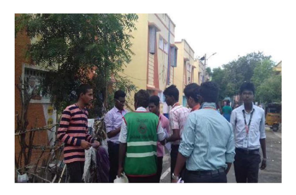
"Swatch Bharat" Gandhi Jayanthi

The Oct 2nd is celebrated in the campus. The students and inmates are encouraged to participate in the cleaning programs organized as per the direction of the swatchhta Pakhwada.